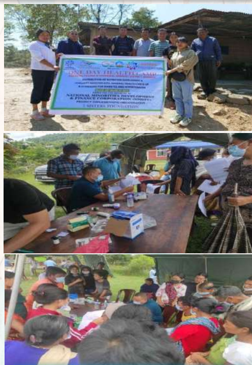
Health Camps in Senapati District, Manipur

During the health camps, a range of medical services to the residents of Lakhamai and Phuba villages were provided. A team of dedicated healthcare professionals, including doctors, nurses, and support staff, served to ensure that every individual received the care they needed. The services offered encompassed general health check-ups, basic medical consultations, and the distribution of essential medications. This effort played a crucial role in addressing immediate health concerns and promoting a healthier lifestyle among the beneficiaries. The organization conducted informative sessions on various health-related topics, hygiene practices, and disease prevention measures. Through CSR support NMDFC has been able to extend support by way of health camps in remote villages of Manipur State.