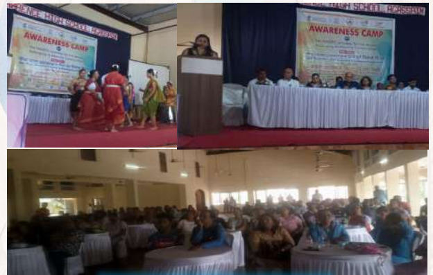
Awareness Camp site view

In order to sensitize the person belonging to minority communities about the benefits of the schemes being implemented by channelizing partners of NMDFC, a Awareness Camp-cum-Loan Mela was organized by Goa State Minorities Finance & Development Corporation (GSMFDC) with the assistance from NMDFC at St. Lawrence Church, Tiswadi, Goa on 12th August, 2023. more than 100 people in and around the locality participated in the camp amongst whom loan application forms as well as schemes pamphlets were distributed. The officials of GSMFDC also described the NMDFC schemes details to the participants.