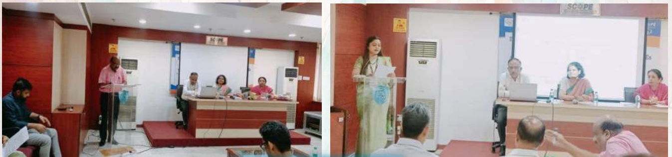
Glimpses of Workshop