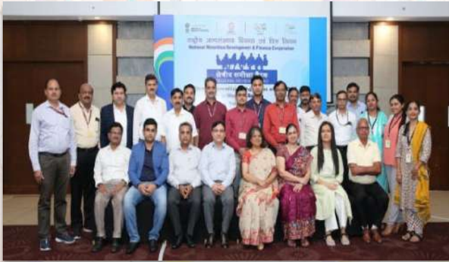
Participants during the Regional Review Meeting at Goa (above) & Raipur (below)