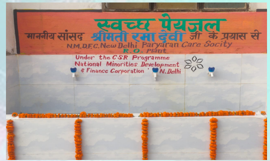
RO plant at Sub Divisional Government Hospital in Pakaridayal, East Champaran, Bihar

NMDFC has installed a Reverse Osmosis (RO) Plant with a capacity of 500 liters per hour at the Sub Divisional Government Hospital in Pakaridayal, East Champaran, Bihar. The plant will provide safe drinking water to patients, staff, and neighboring residents in the area, as the groundwater in Pakaridayal is contaminated with impurities detrimental to health. The initiative of NMDFC will help to improve the health and well-being of the local population by providing access to clean drinking water. Smt. Rama Devi, Member of Parliament (Lok Sabha) for the parliamentary constituency of Pakaridayal, East Champaran, and Chairperson, Parliamentary Standing Committee on "Social Justice & Empowerment" Govt. of India, expressed gratitude for the support provided by NMDFC.