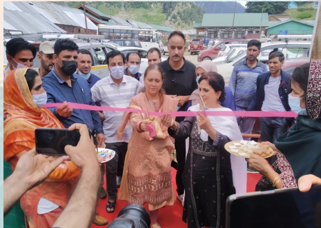
MD, JKWDC inaugurating the exhibition