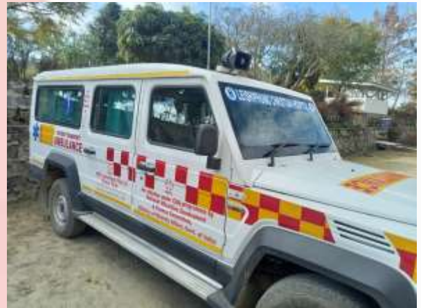
Ambulance at Leishiphung Christian Hospital campus

This will be particularly beneficial for those living in remote areas and need easy access to emergency medical care. Ambulance will also be used for organizing Health Camps in far flung areas in the Ukhrul District and enable the LCH to provide various humanitarian services for the betterment of the society.