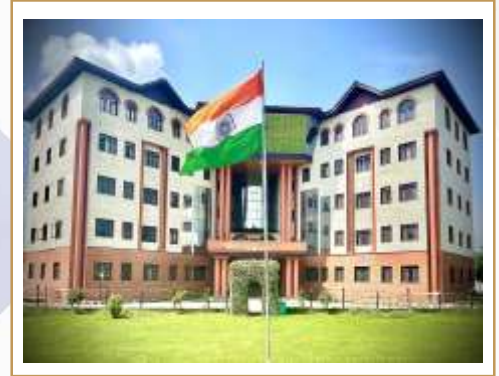
JKEDI Srinagar campus

The Entrepreneurship Development Program (EDP) of JKEDI covers a wide range of topics such as idea assessment, planning, product development, pricing, marketing, accounting, and finance, and includes various simulation-based modules, market surveys, research, expert classes, and industry exposure. Candidates interested in the EDP are interviewed to assess their suitability and are offered training and financial benefits.