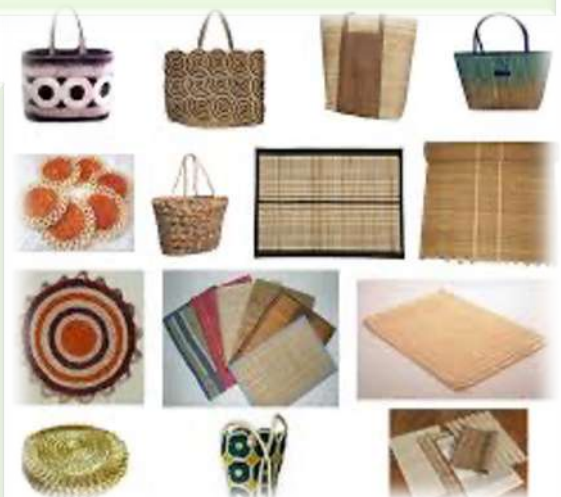
Products made from Banana Fiber

The banana fiber is being used for weaving of clothes, rugs, sarees etc. Besides, it is also being used to produce a variety of items such as hats, photo frames, trinket boxes, gift bags, picture frames, hand bags, belts, baskets and sandals etc. The fiber can also be used in manufacturing mattresses, pillows and cushions in the furniture industry. Dresses woven out of banana fibers are in great demand inside and outside India. To make currencies, bond papers, and speciality papers which can last for 100 years, as a very good replacement for wood pulp in paper industry, as it has high cellulose content, thus reducing the Environmental impact of deforestation. In making composite materials as a replacement for fiber glass.