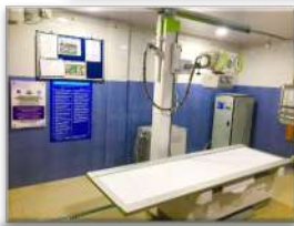
X-Ray machine in General Hospital in Pathanamthitta, Kerala