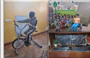
Equipments for the Students with special needs at Okhla Delhi