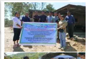
Health Camps in Senapati District, Manipur

During the FY 2023-24, NMDFC has sanctioned 24 projects with assistance of ₹2.14 Cr. under the CSR mandate of Ministry of Corporate Affairs for welfare of society and to provide support to the underprivileged section of the Country. Following are the major areas in which these projects has been sanctioned: