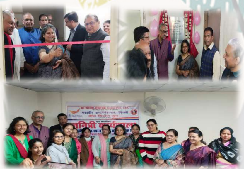
Dedication of Dental Chair to Mahavir International