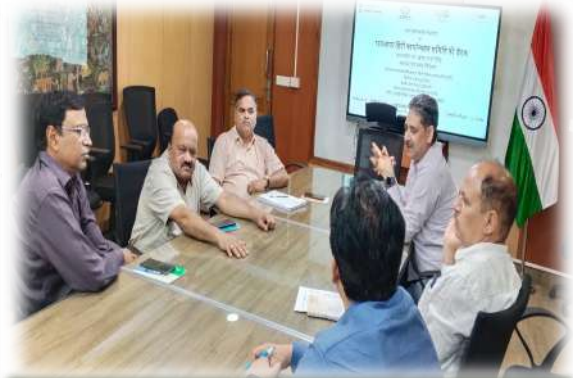
Officials of NMDFC discussing during the Committee Meeting

Another meeting of Official Language Implementation Committee was held on 28 th March, 2024 at the Corporate Office of NMDFC. The main agenda of the meeting was to review the use of Official Language during the Quarter ending Dec, 2023. The ways to increase the use of Official Language in the working of Corporation was discussed. Use of Indic Input methods to increase the efficiency while working in Hindi were also discussed.