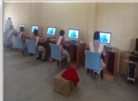
Computers to Girls College, Barabanki, UP