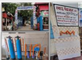
RO Plant at Sadar Hospital, Muzaffarpur, Bihar