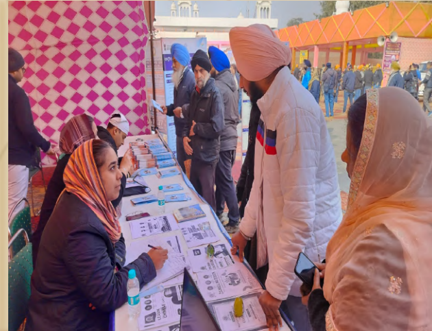
NMDFC Loan scheme awareness camp site view