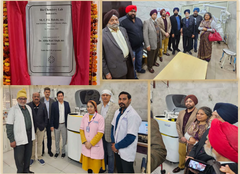
Dedication of Biochemistry Analyzer to Gurudwara Singh Sabha Saheb

NMDFC has supported Guru Nanak Charitable Dispensary, Rajouri Garden, New Delhi by providing Bio-Chemistry Analyser under the CSR programme of NMDFC. Earlier, Guru Nanak Charitable Dispensary was facing difficulty in providing clinical test result to all the visiting poor & needy patients in time bound manner and they requested NMDFC to provide Fully Automated Bio Chemistry Analyzer machine. This machine would be utilized to provide timely clinical results to the needy people of Rajouri Garden and nearby areas in Delhi.