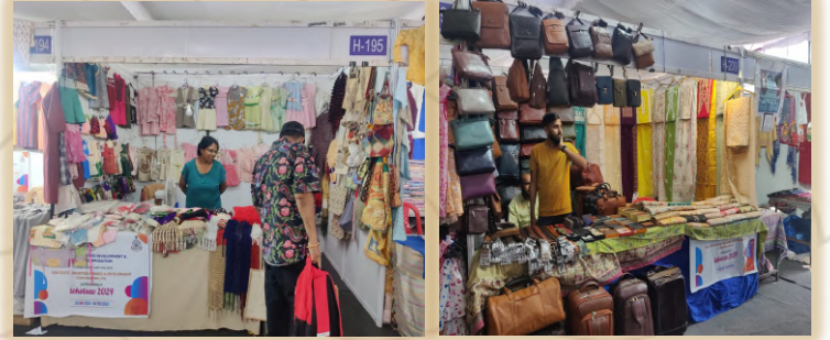
Artisans showcasing their products to the visitors during the Exhibition