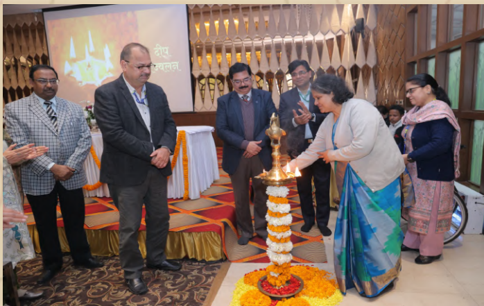
CMD NMDFC lighting the lamp at the beginning of meeting