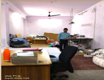
Sh. Kalu ram's Clothing Store